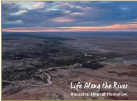
An image from the Homol'ovi exhibit