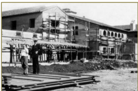
La Posada under construction in 1929