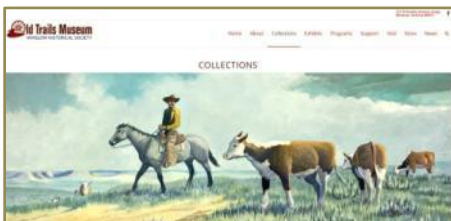
The OTM Website Collections page