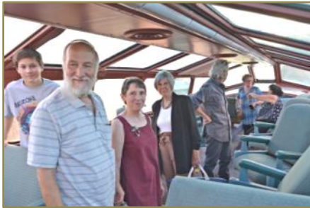
Party guests touring the 502