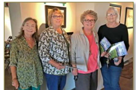
Local residents attended Holden's AZ Highways talk at the WAT Museum