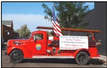
The 1940 Ford Seagraves fire truck