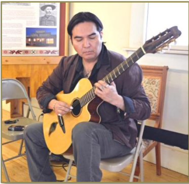
Khent Anantakai performs