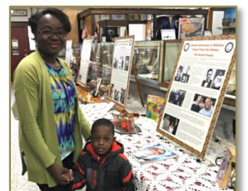
Visitors at OTM's "A Stroll Through Black History" event