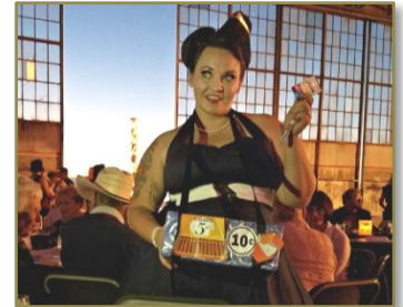
A stylish volunteer at the Fly Back in Time Gala