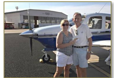
Visiting pilots at the Fly-In