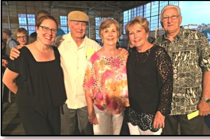
WHS Board members & spouses at the Gala

Go to the High Desert Fly-In website for the latest details on the 2017 event, and find us on Facebook. We hope to see you again next year!