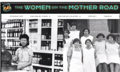
The "Women on the Mother Road" website homepage