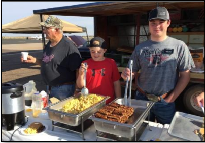
The Rotary's Pancake Breakfast