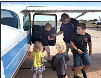
Free airplane rides for the kids!