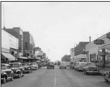
Second Street in downtown Winslow became US Route 66 in 1926.