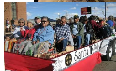
Reunion attendees ride in their float during the 2012 Christmas Parade.