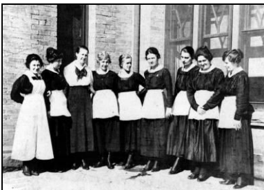
These 1918 Harvey Girls will be featured in AHC's postcard book.

For the latest updates on all Journeys to Winslow events, check OTM's website and Facebook page!