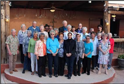
Attendees pose for a group shot during the OTM Volunteer Thank-You Party.

We also have 207 fans of the museum's Facebook page, which has been a very effective tool for publicizing our activities and public programs.