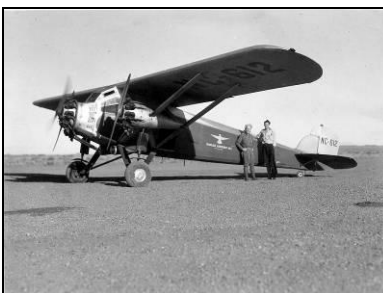
This Kreutzer tri-motor was based at Winslow's historic airport in the 1930s.