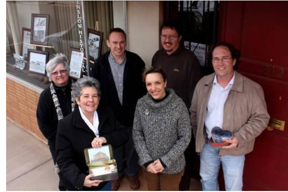
Project partners meet at OTM over this past winter, with geocache samples in hand.

For more information on the series and geocaching in general, go to www.Geocaching.com and search for “Historic AZ66.”